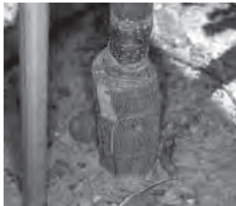
Left: Fire blight infected M.26 rootstock. The presence of bacterial "ooze" and blackening were symptoms of infection leading to tree death. Right: Fire blight resistant G.16 rootstock. Although blackening of some G.16 rootstocks was observed following inoculation of the Gala scion with fire blight bacteria, blackened tissue exfoliated, or peeled off, revealing underlying healthy tissue. None of the inoculated trees on G.16 died.

green leaves in the fall, although many branches had brown, dead leaves because of scion infections.