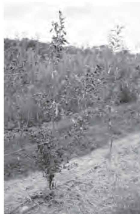
Complete tree loss results from a fire blight infection in the M.9 rootstock of this Royal Gala tree. The rootstock phase of fire blight can greatly reduce the profitability of high-density orchards.

appropriate conditions, the internal spread of fire blight bacteria appears to take place very soon after the initial infection.